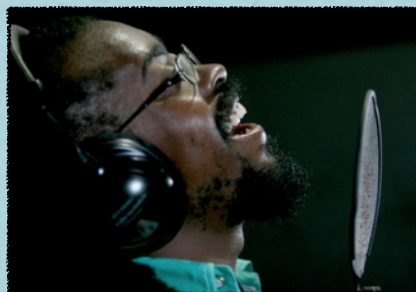
BEANIE MAN laying down his flavor and bringing it home.